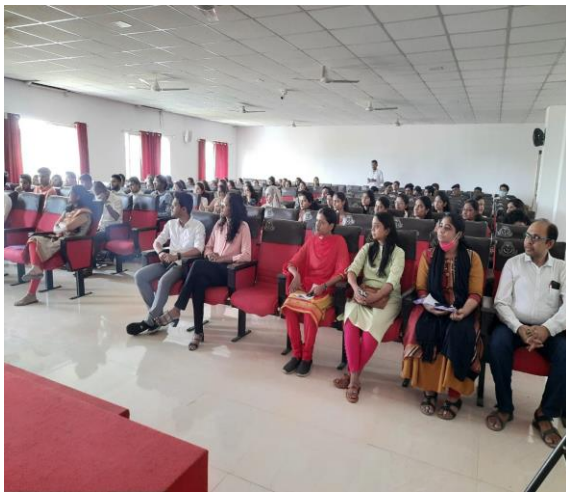
Alumni meet 2022