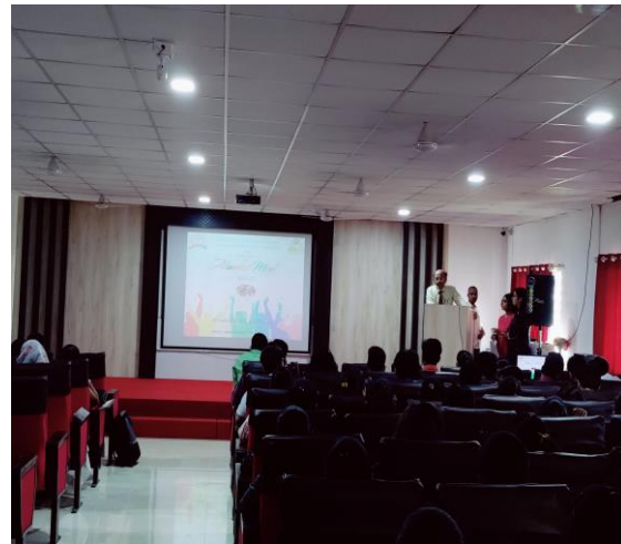
Dr.K.R.khandelwal addressing to alumni and students